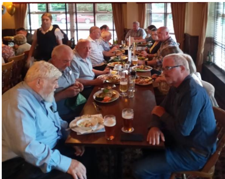
16 Section members attending the Old Mill