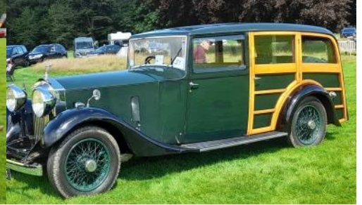
A very practical and spacious 20/25 “estate” car.