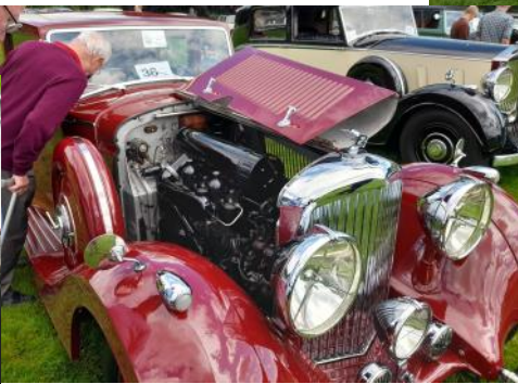
Putting the RREC Annual Rally at Burghley House to shame. Some very interesting entertainment on display.