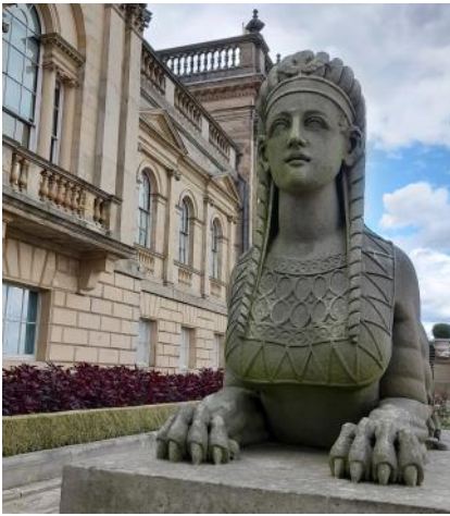
Harewood House continued.