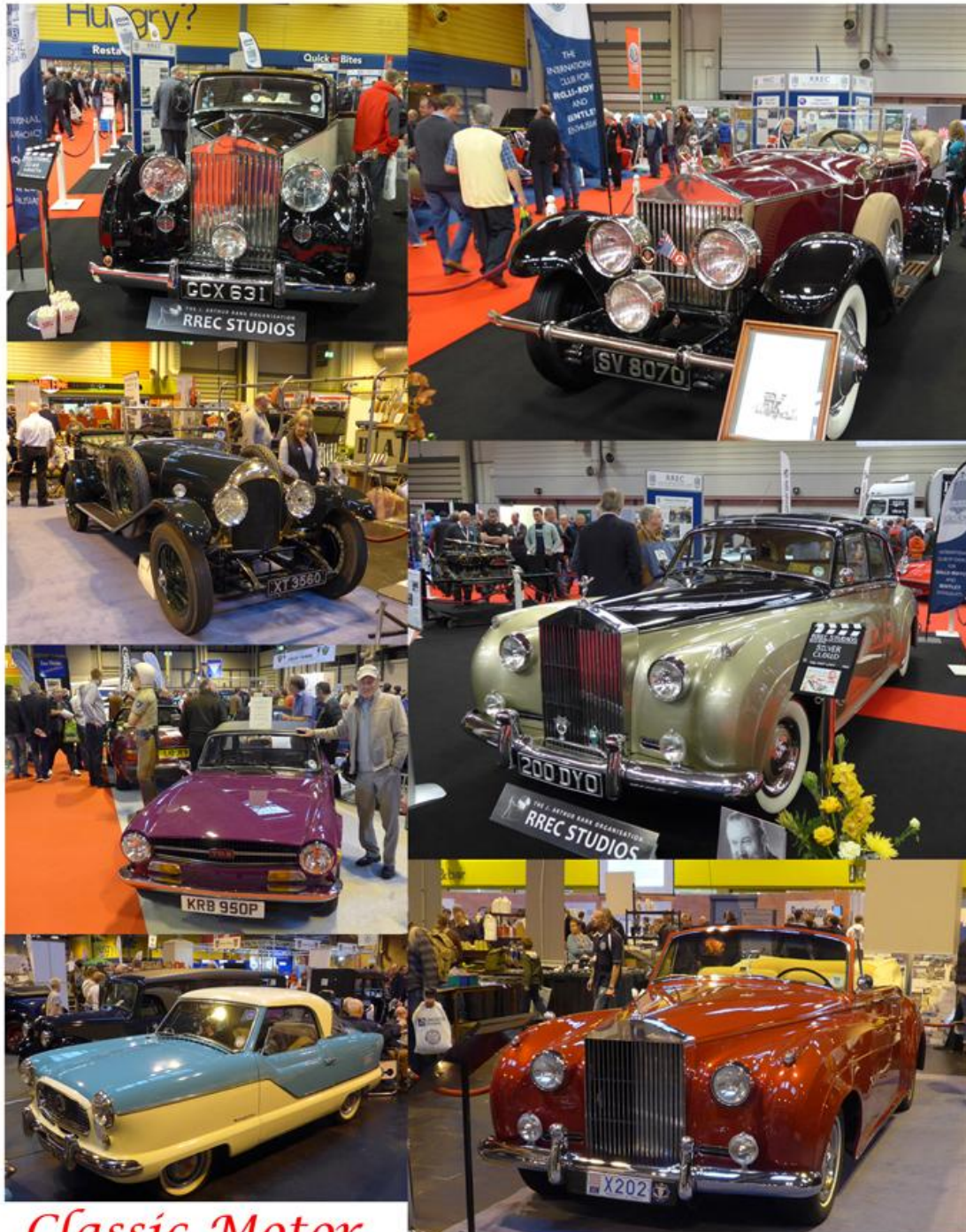
Classic Motor Show 2014