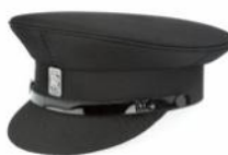
R-R & Bentley Chauffeur's Hats

Memorabilia and automobilia online valuation service.