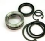
RA2240 Ram Kit £15

We buy, & part-ex used original parts and memorabilia.