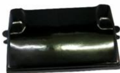
Battery Cover UD 1679