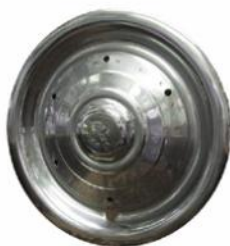
R-R & B Stainless Steel Wheel Trims

Best prices & discounts for club members