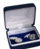
Cufflinks R-R & Bentley Silver & Gold