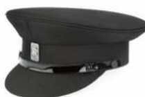
R-R & Bentley Chauffeur's Hats

Memorabilia and automobilia online valuation service.