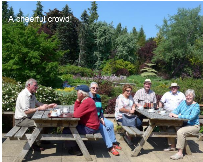
A cheerful crowd!

I attended one of the birds of prey displays. First out were two Caracara birds who clearly knew the form waiting excitedly and expectantly to be let out of their cage. Named George and Mildred there were to be no offspring as despite building a nest it turned out that the birds were both male! These two did not fly but ran around the arena for titbits with a gait a bit like the roadrunner cartoon character. The handler described them as the equiv-