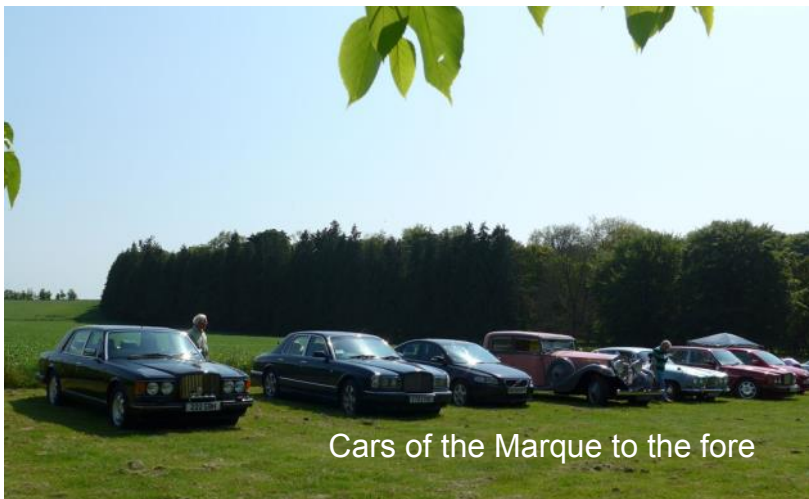
Cars of the Marque to the fore

alent of seagulls in their home environment where hunting in groups of up to 30 they are seen as pests. Next up was a large owl whose silent progress from perch to perch in very close proximity to the public was a sight to behold. The final display was from the flight of a falcon whose high speed stoops to try to take the lure of the handler evidenced the high speed