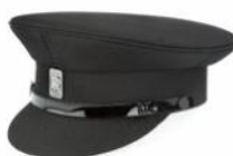
R-R & Bentley Chauffeur's Hats

Memorabilia and automobilia online valuation service.