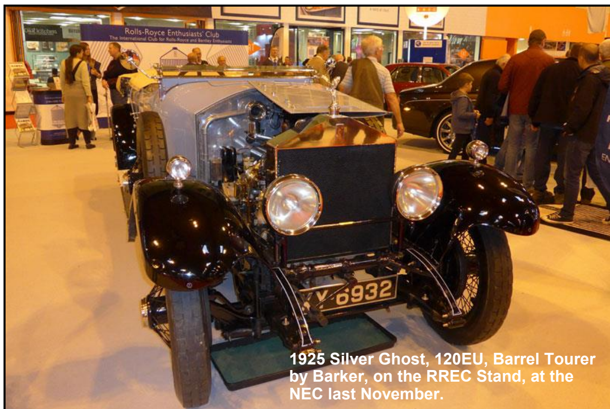
1925 Silver Ghost, 120EU, Barrel Tourer by Barker, on the RREC Stand, at the NEC last November.