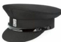
R-R & Bentley Chauffeur's Hats

Memorabilia and automobilia online valuation service.