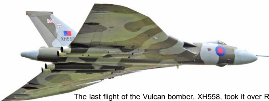
The last flight of the Vulcan bomber, XH558, took it over RAF Leeming.