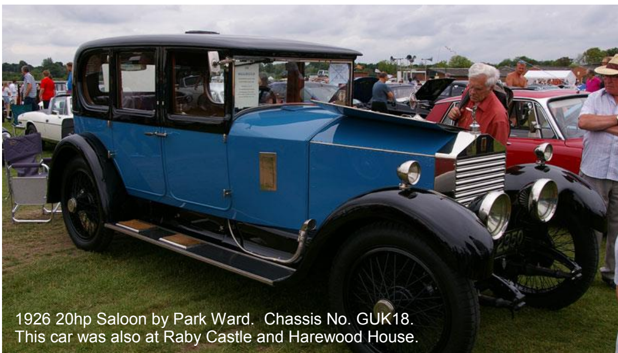
1926 20hp Saloon by Park Ward. Chassis No. GUK18. This car was also at Raby Castle and Harewood House.