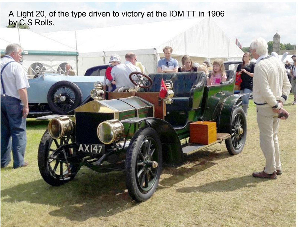
A Light 20, of the type driven to victory at the IOM TT in 1906 by C S Rolls.