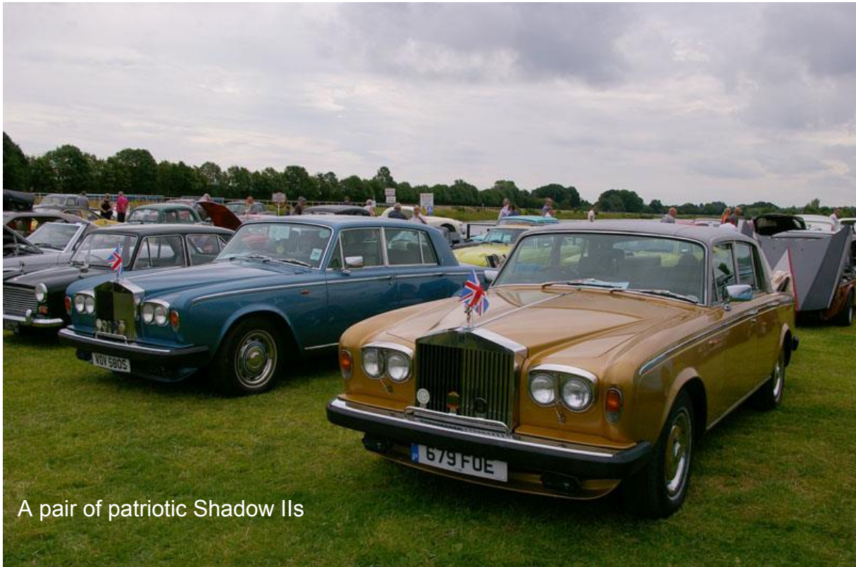
A pair of patriotic Shadow IIs