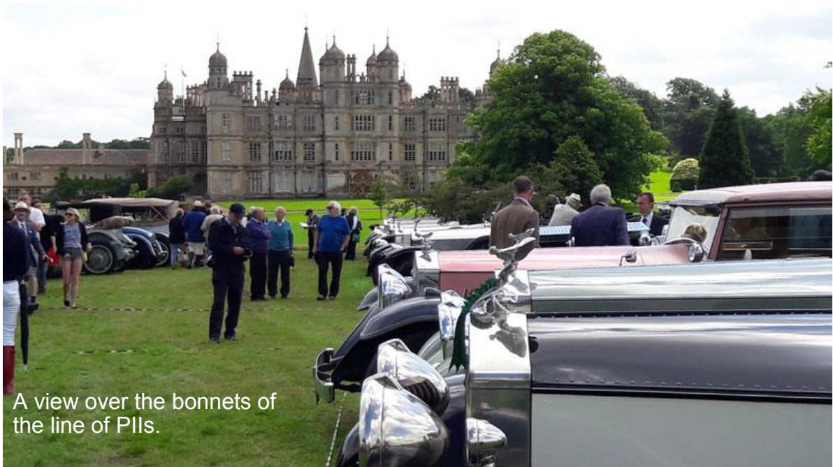
A view over the bonnets of the line of P11s.