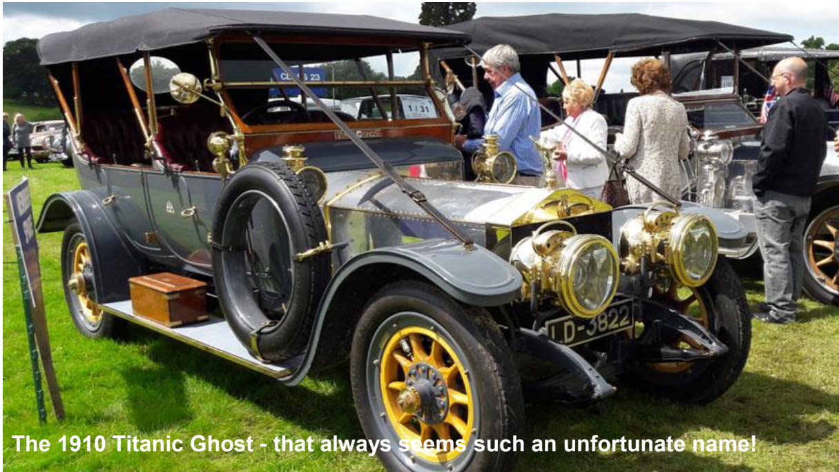
The 1910 Titanic Ghost - that always seems such an unfortunate name!