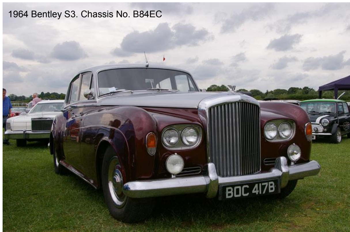
1964 Bentley S3. Chassis No. B84EC