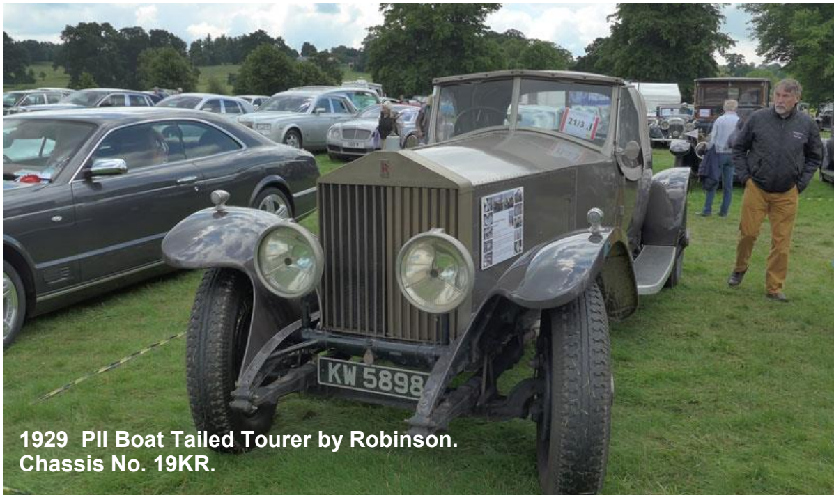
1929 P11 Boat Tailed Tourer by Robinson. Chassis No. 19KR.