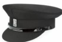
R-R & Bentley Chauffeur's Hats

Memorabilia and automobilia online valuation service.