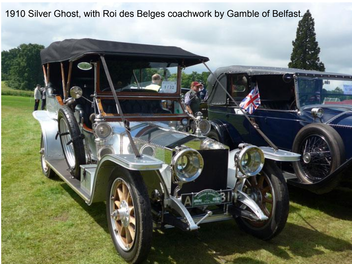
1910 Silver Ghost, with Roi des Belges coachwork by Gamble of Belfast.