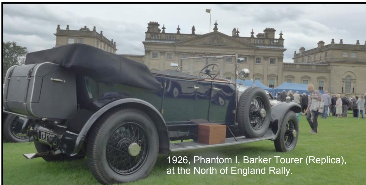
1926, Phantom I, Barker Tourer (Replica), at the North of England Rally.